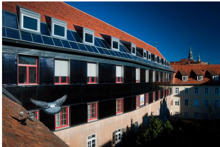
Franziskanerkloster Graz

The building shows how photovoltaic facades which might be perceived as a burden from a preservation perspective.