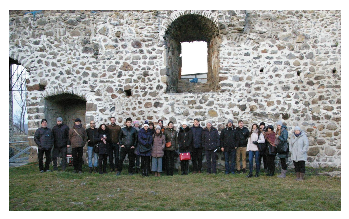
Participants of study visit in fort Bzovík

To get more details about study visit in Bzovík Monastery please click <a href="http://www.interreg-central.eu/Content.Node/study-visit-report-Slovakia-Bzovik.pdf">http://www.interreg-central.eu/Content.Node/study-visit-report-Slovakia-Bzovik.pdf</a>