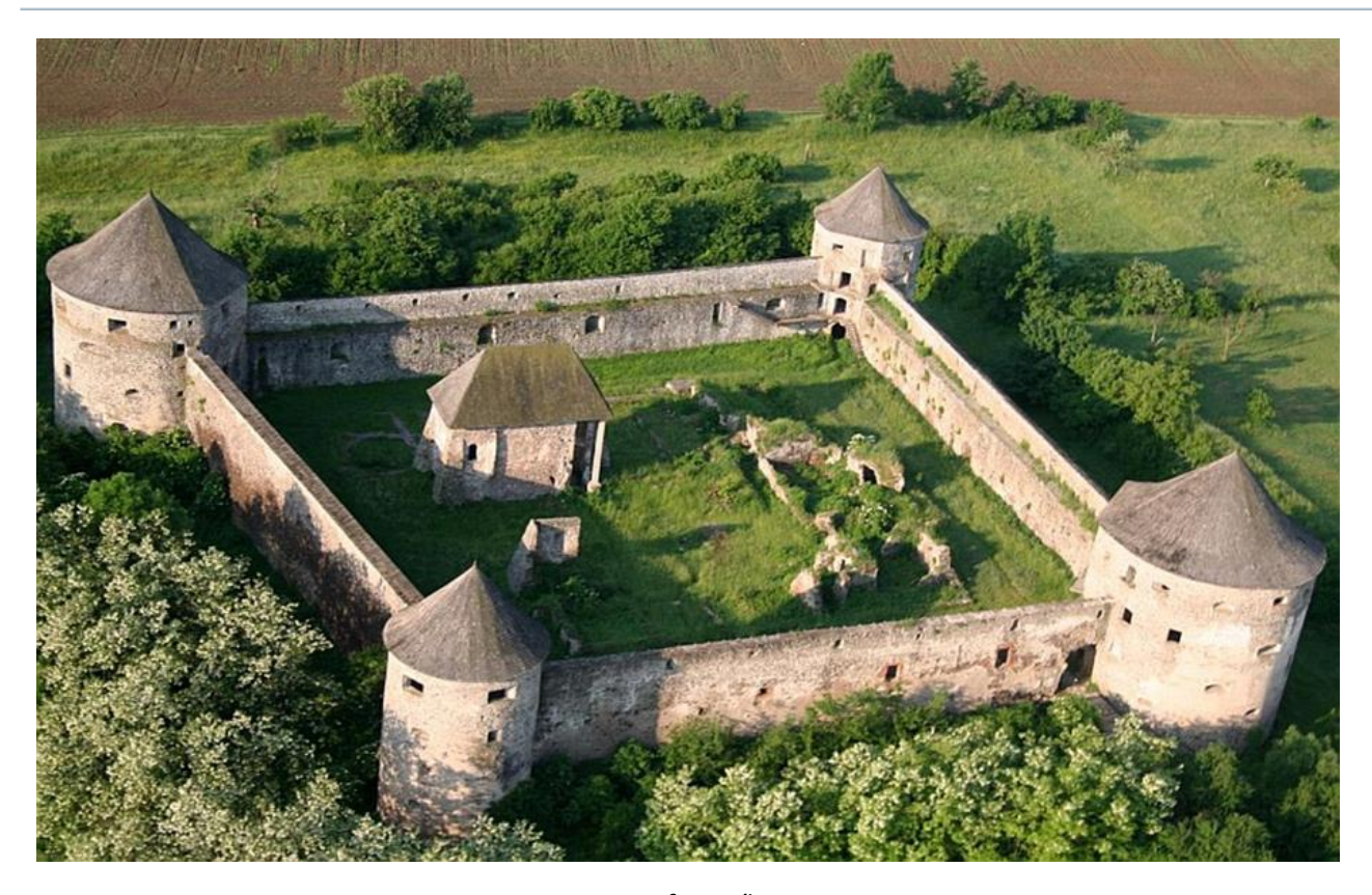
Current state of Bzovík Monastery