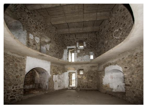
Ruins of Balassa's Chapel