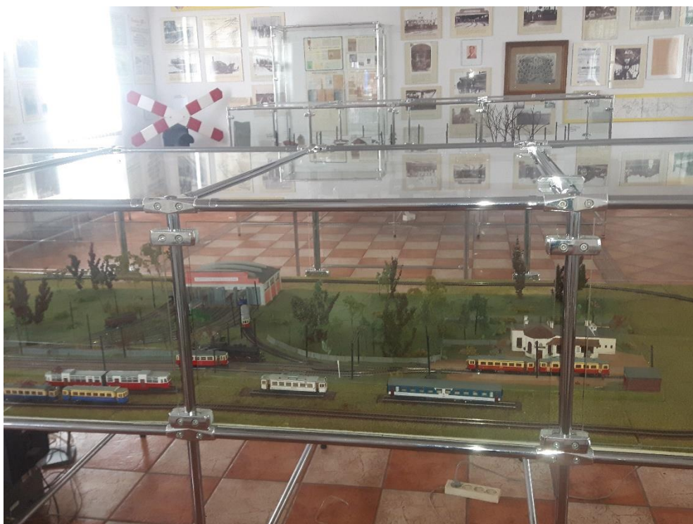
Fig. 4 - Interior view of the building, "Railway mockup"