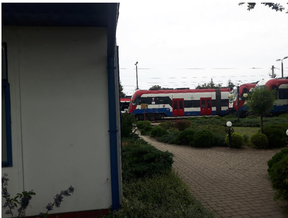
Fig. 3 - View from the station towards the technical facilities of the WKD.