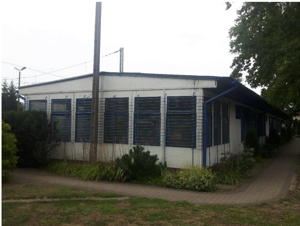
Fig. 2 - View of the building involved in the revitalization project.