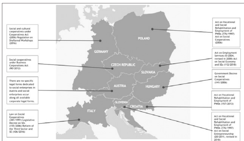
Figure 3.2. Legal frameworks or statuses for SEs in the different CE countries.

In the figure below we can see which legal references for each Central European country determine and direct the legal framework. Subse-