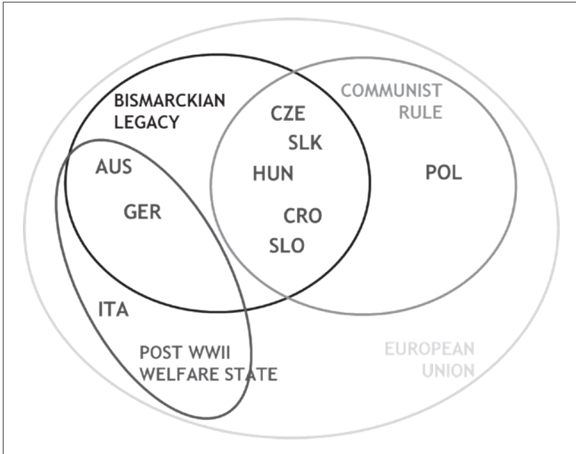
Figure 3.1. Classification of countries according to NPOs sector's historic establishment.

This represent the historic framework in which SEs are called to spread their activities in the considered countries.