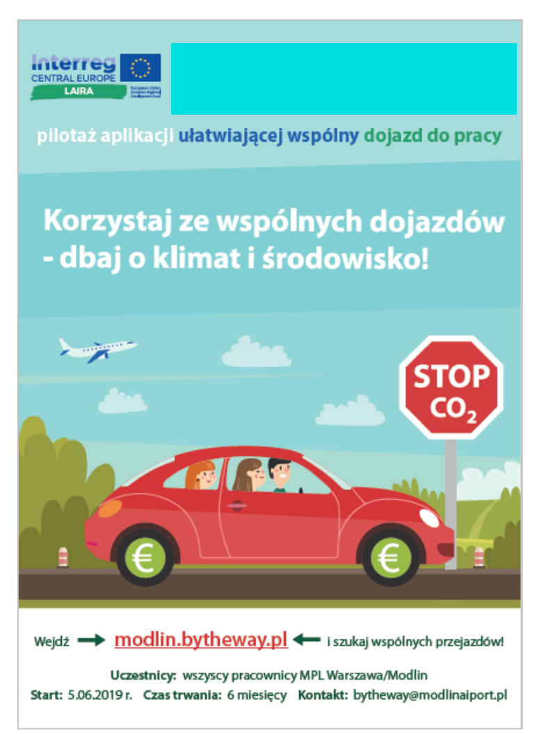
Fig. 3 Poster promoting the pilot