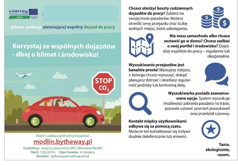
Fig. 4 Leaflet promoting the application