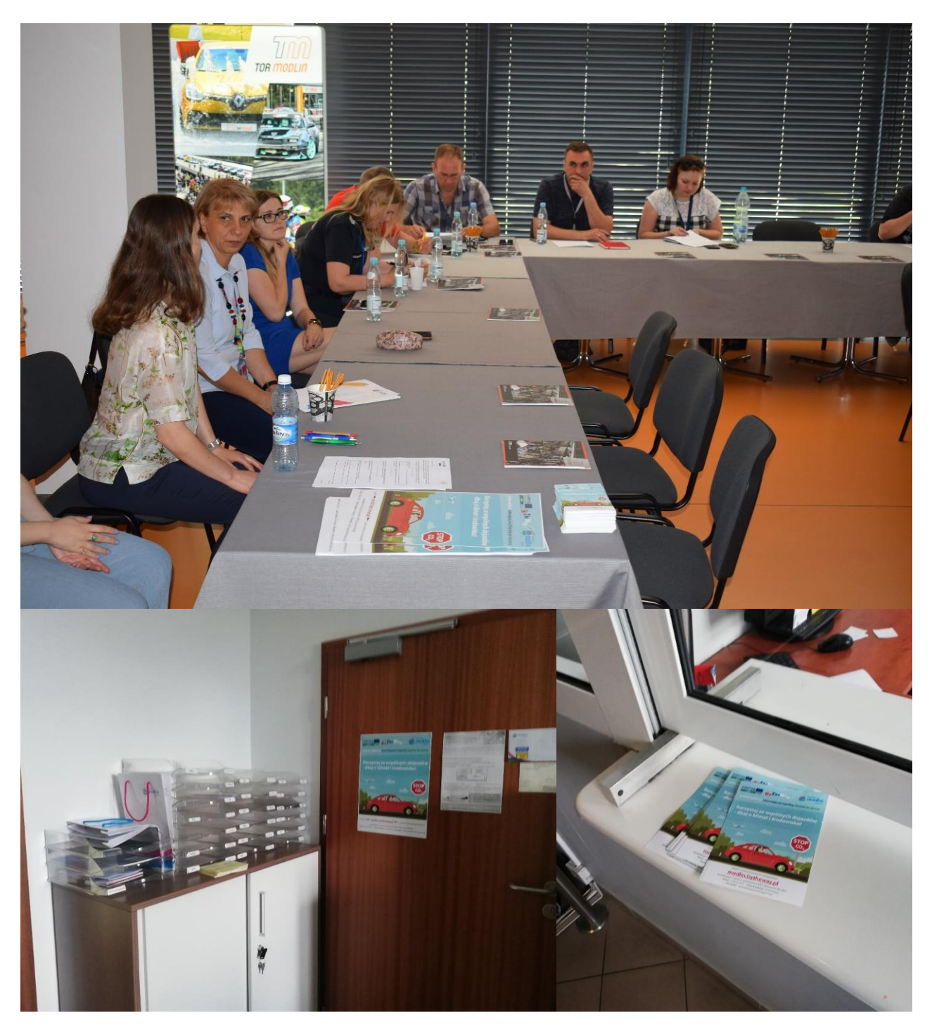
Fig. 5 Meeting at the Tor Modlin in Nowy Dwór Mazowiecki and promotion materials from the campaign