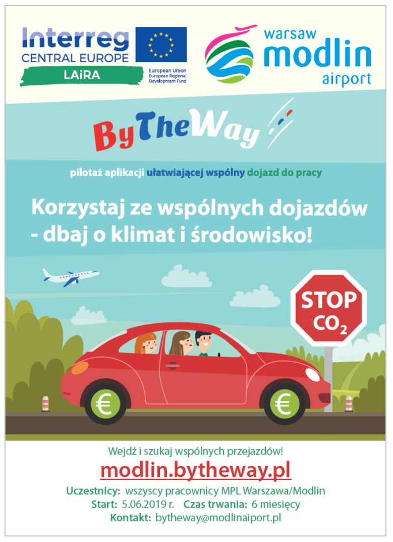
Fig. 2 Poster (slogan: share your rides - take care of the climate and environment)

The platform was used on a non-exclusive license. The owner of the platform was Fabryka w chmurach Sp. z o. o. which won the public procurement for the provision of the platform. Payment for the platform was made once after the launching of the platform and on a monthly basis from June to December (6 months). The purchaser was the Mazovian Office of Regional Planning in Warsaw. All IT related issues were the subject of the contract and thus the responsibility of the contractor.