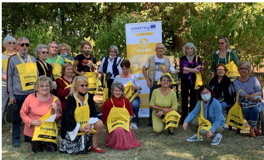
An event in Bologna with seniors and local stakeholders