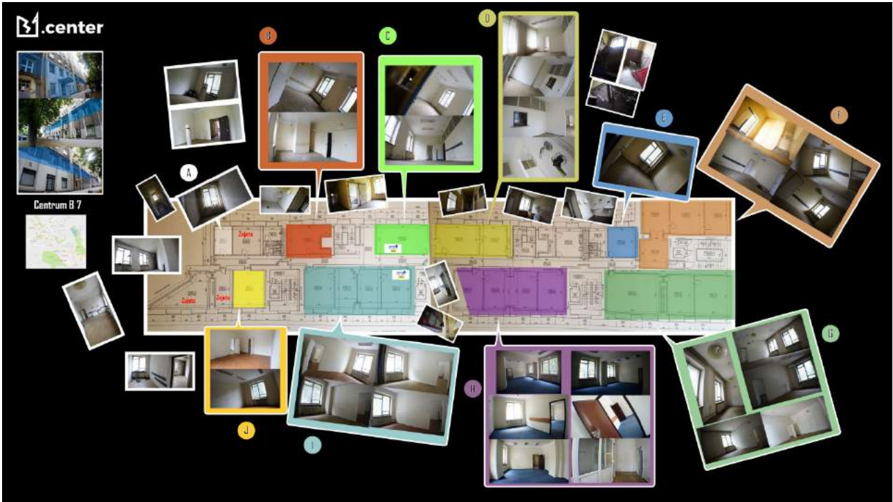
Rooms plan of Center B7.

called Nowa Huta 2.0) and Playpark location there, the image of the quarter is gradually improving, and the local space and social life is reviving. Playpark has been created by PP13 Municipality of Kraków with the support of PP14 Cracow CCI and is run in cooperation with Association B1 – a group of young people dedicated to social revitalisation and building positive image of Nowa Huta.