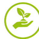
Plastika Skaza: materials used in production process