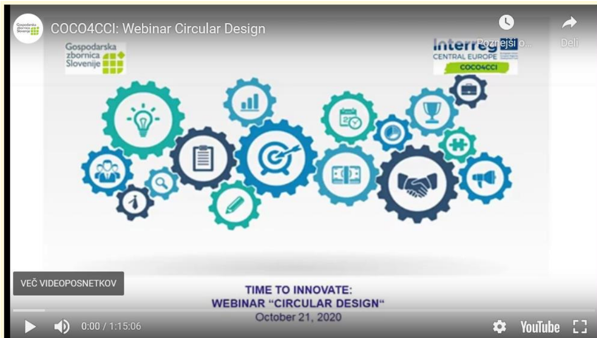
Mindset of AVM: webinar Circular design