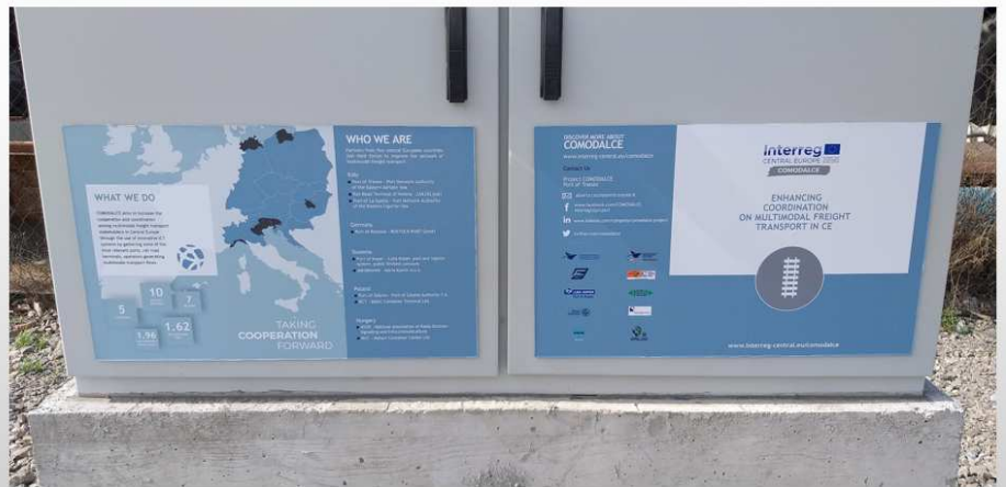
Figure 3: Interreg promotion of OCR system in the port of Koper