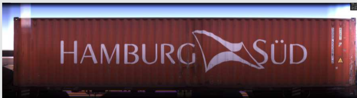
Figure 5: OCR system scanning in the port of Koper