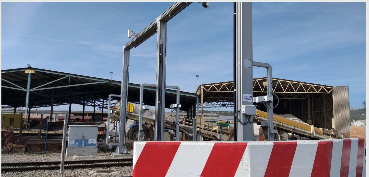
Figure 4: OCR system installed in the port of Koper