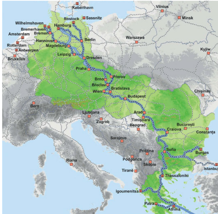
(c) New railway line Dresden-Prague EGTC