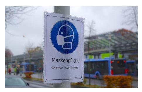
The Corona pandemic currently renders physical meeting impossible

During the digital meeting on 10-11 June, there was a review of pilot activities and on the pilot action first intermediate assessment. Furthermore, the decision-support tool was presented.