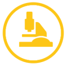
Table of content