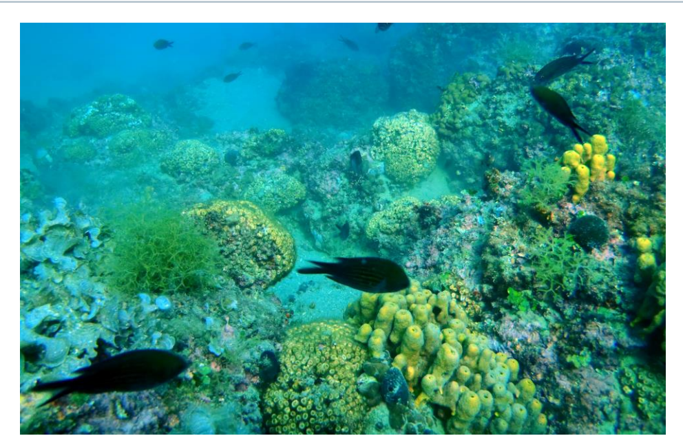
Figure 5: Sea bottom in Strunjan Nature Reserve

The rhythm of life in the eulittoral, or intertidal, zone is dictated by the tides. The sea organisms living here pass the periods of low tide outside the water, unsheltered from the hot sun, dehydration, wind and rain. The acorn barnacle ( Chthamalus depressus ) has a calcareous shell which protects it from scorching heat and dehydration during low tide. Fucus virsoides is a common brown alga of rocky seacoasts. It is characterised by holdfasts for clinging to rocks and mucilage-covered leaves that resist desiccation during periods of low tide. F. virsoides is an endemic species, found exclusively in the Adriatic Sea. The Mediterranean shag ( Phalacrocorax aristotelis desmarestii ) is a subspecies of the family of cormorants. From late spring until autumn, over 1,500 specimens - i.e., 11 % of the global population of this subspecies - sojourn in the area of the Slovene sea. In Slovenia, the Mediterranean shag is a protected bird species.