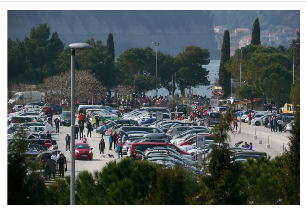
Figure 8: Tourism "hot spot" in Strunjan Landscape Park in summer

Our efforts are directed towards achieving a form of tourism that can be implemented with minimal longterm effects on the planet and can serve as an example to other protected areas around the world. A pristine, authentic natural environment and the care for it are turning into an increasingly significant task, as well as an investment for the tourism of the future.