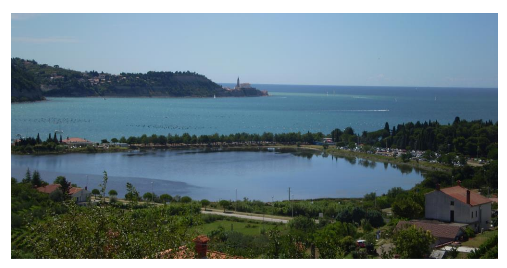
Figure 3: Marine lagoon Stjuža

Today, the lagoon area is an important part of the Strunjan Stjuža Nature Reserve, falling within the Natura 2000 network, the primary objective of which is to preserve biodiversity by safeguarding the habitats of endangered plant and animal species that are relevant not only for Slovenia, but for the entire European Union (Figure 3).