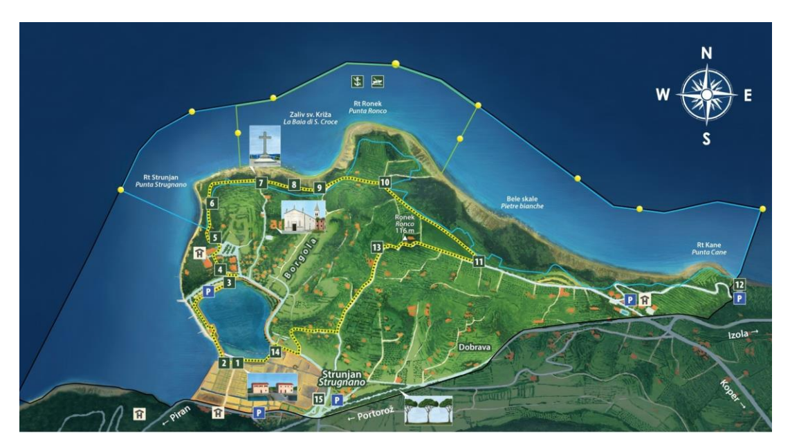
Figure 1: Map of the Landscape park Strunjan

Landscape Park Strunjan covers 428.6 hectares, comprising a 4 km long shore of the Gulf of Trieste. The area of the park extends over the Strunjan Peninsula from Simon Bay to the mouth of the Strunjan River, including a 200 m long sea belt and the inner part of Strunjan Bay (Figure 1).