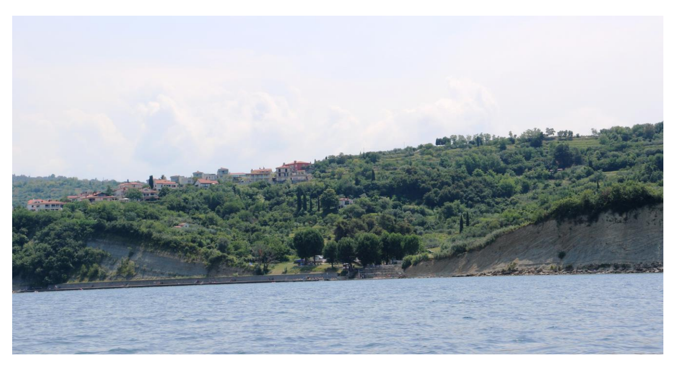
Figure 7: Belvedere terraces - pilot area

The area is hilly with quite a slope. It is arranged in the form of terraces, which are mostly private plots with olive groves. The area is rather uneven and individual parcels users are more or less maintained and restricted by various fences. The terraces extend to the sea shore, where the small area for bathing is arranged, with a pier, parking space and a bar, which is surrounded with cliffs from both sides (Figure 7).