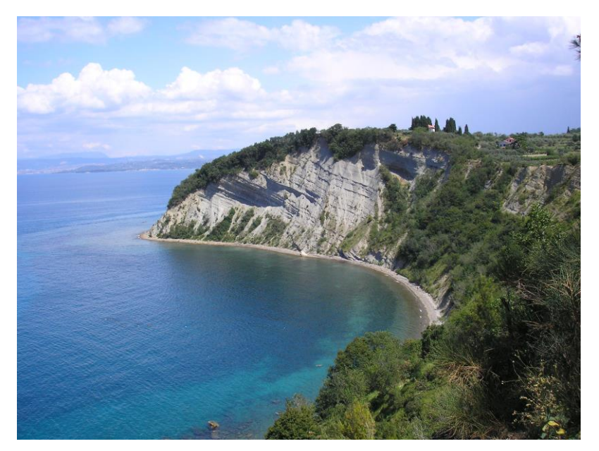
Figure 4: St. Cross Bay with flysch cliff

The most distinctive part of Landscape Park Strunjan are its cliffs, up to 80 metres high, which have been, together with their bosky edges and the 200-metre-wide sea belt underneath, declared a nature reserve. This is also the longest stretch of natural seashore in the entire 130 kilometre coastline between Grado, Italy, and Savudrija, Croatia, which circumscribes the Gulf of Trieste. The precipitous faces and the pebbly beach at the foot of the cliffs are entirely left to natural processes, which constantly mould the friable layers of rock, finely chiselling their features (Figure 4).