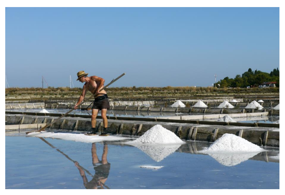
Figure 6: Salt harvesting in Strunjan salt pans

In the saltpans, marine salt is obtained through natural crystallisation in the process of solar and wind evaporation. For that to occur, the seawater, or brine, has to complete the entire course of the saltpans, guided through salt ponds in which it becomes progressively denser (Figure 6).