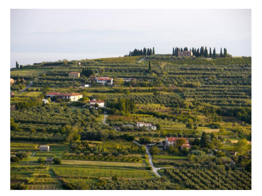
Figure 2: Agricultural landscape

The cultivated slopes, converted into terraces, are most often supported by dry-stone walls built without binding agents, which create living spaces for numerous animal species.