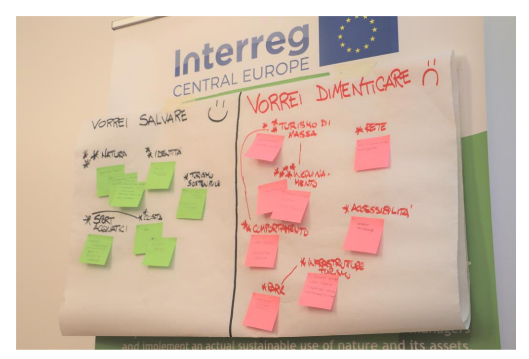
Figure 10: Participators suggestions of positive and negative aspects of the Park