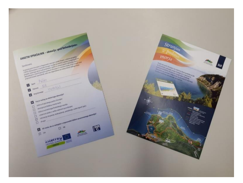
Figure 6: Answered questionnaire and leaflet to take away

An additional awareness-raising action was the creation and distribution of an educational animation video of the protection regimes in the Park.