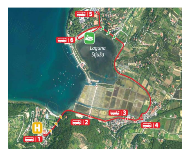
Figure 8: Leaflet with schedule, the bus route and stops