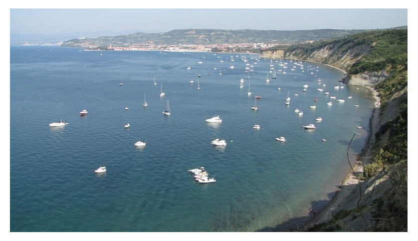
Figure 2: Tourism pressure on the coastline