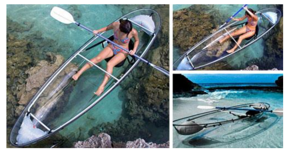
Figure 9: Sustainable water sport activity to visit the Park in a more sustainable way

Above all, the development of a glamping site and new catering services would provide new jobs, and the info point would need additional employees.