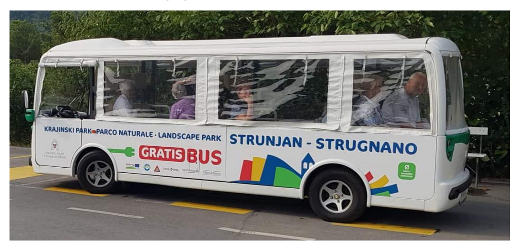
Figure 5: Electric bus with the CEETO logo