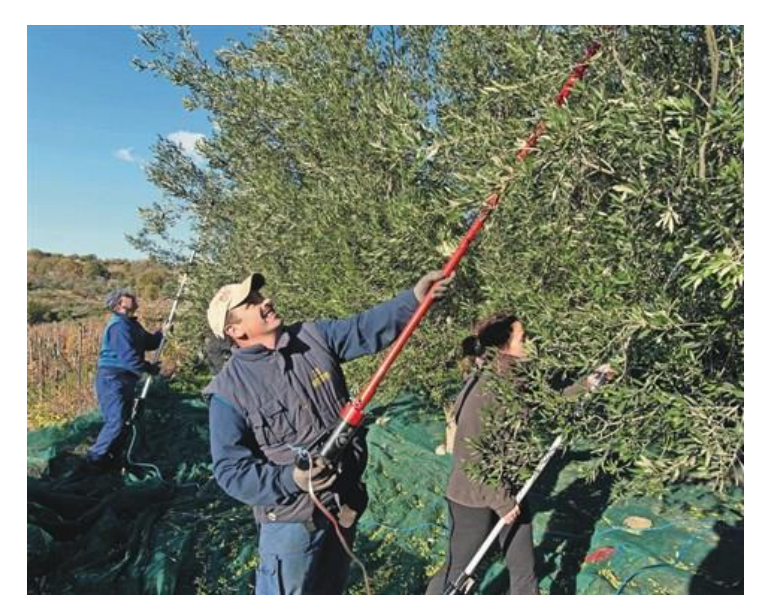
Figure 10: Olive harvesting