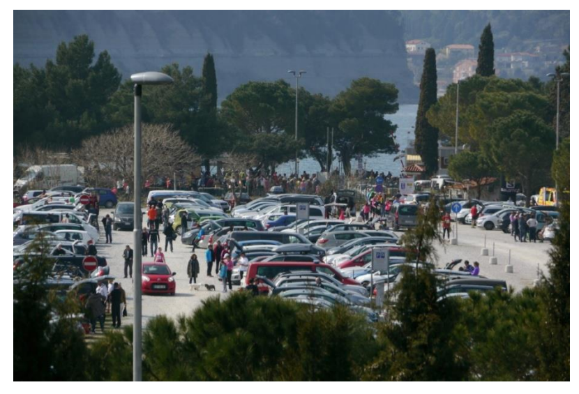
Figure 1: Tourism "hot spot" in Strunjan Landscape Park in summer

The increasing tendency towards spending more leisure time in and around protected areas also means a larger number of visitors in ecologically sensitive areas, with the associated intensification in land use and pressure on such areas. It was observed that tourist do not behave responsibly and they do not comply with rules of the protected area (they access the beach through different points, walk outside designated trails; park outside the parking area and are not aware that they are in a protected area; camp illegally; light open fires, etc.).