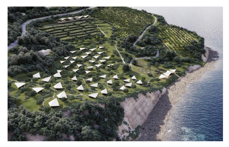
Figure 7: Study on landscaping and spatial planning solutions

Pilot action_2<sup>nd</sup> part - Alternative ways of visiting the park is composed by 3 main activities: