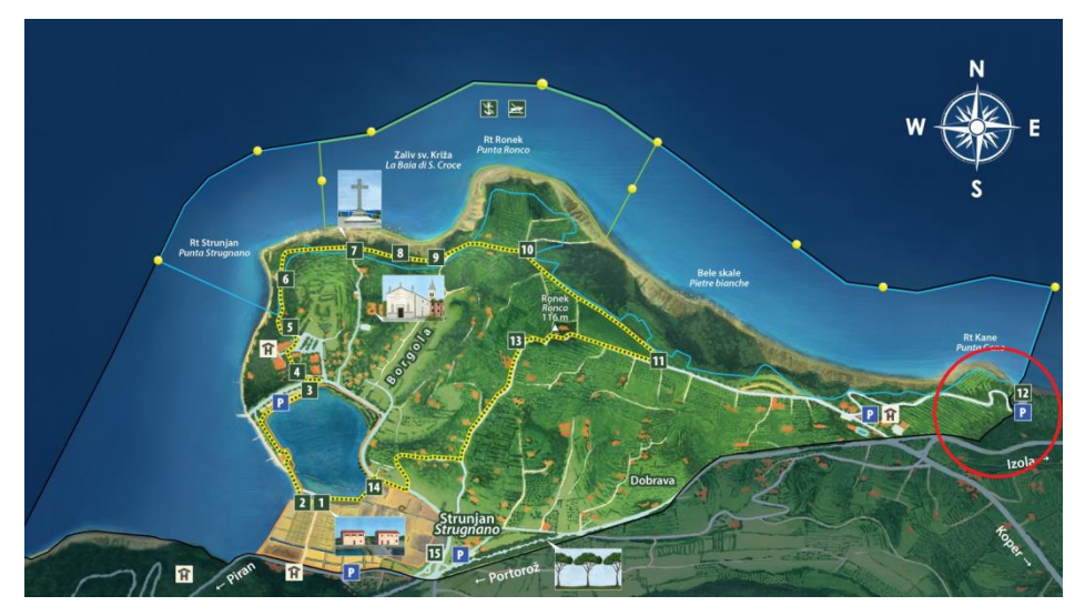
Figure 4: Pilot Area - Belvedere terraces (monitoring area)

In cooperation with the Municipality of Izola, which is also the owner of the land of Belvedere terraces, we set out the content of one part of the pilot action (the regulation of the Belvedere terraces). The goal is to regulate this area and to provide socio-economic benefits to local communities.