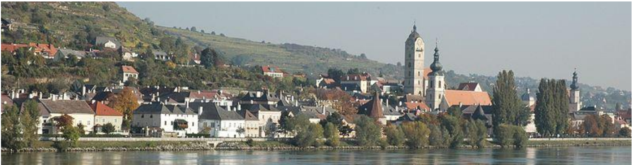
Figure 1: Panoramic view of Stein an der Donau. 1

Krems and Stein are twin towns on the north bank of the Danube. Both owe their development and historic significance to their location along the main route from East to West along the Danube and their function as a point of reloading from river to land traffic, the cultivation of grapevine and the resulting trade. Krems and Stein, which is part of the municipality of Krems but a former independent city, both have old towns that date back to the Middle Ages, complete with parts of the old city walls and gates. Krems and Stein are also part of the UNESCO World Heritage Region Wachau, and lie in its buffer zone. 2