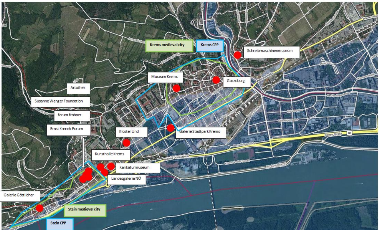
Figure 3: Areal view of Stein on the left and Kreams on the right with their medieval city centres and main museums. 9

Emergency plans like the one outlined above are in development together with the relevant stakeholders. The fire brigades as the most likely first responders will be included into the development. The map above does not take the mobile flood protection into account and shows the flood zones of a HQ 30 and 100 (lighter shade of blue). The mobile flood protection as adopted measure against floods is described in detail in deliverable D.T1.3.2 and highly functional. The biggest risk concerning flood is the possibility that the mobile elements might break when a heavy item brought downstream the flooded Danube crashes into the mobile section or if the water rises even higher than 2013 and the mobile protection is simply not high enough.