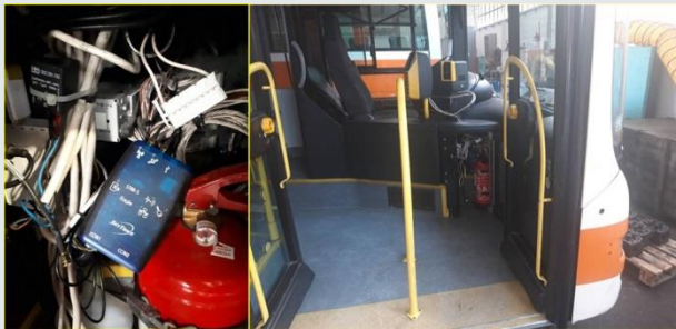
Fig 01 - Tracking device installation

Link: https://final-solez.webnode.cz/english/