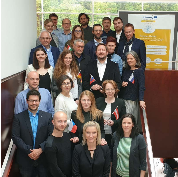
Group photo of the partnership at the ProsperAMnet kick-off meeting on 6-7 May 2019