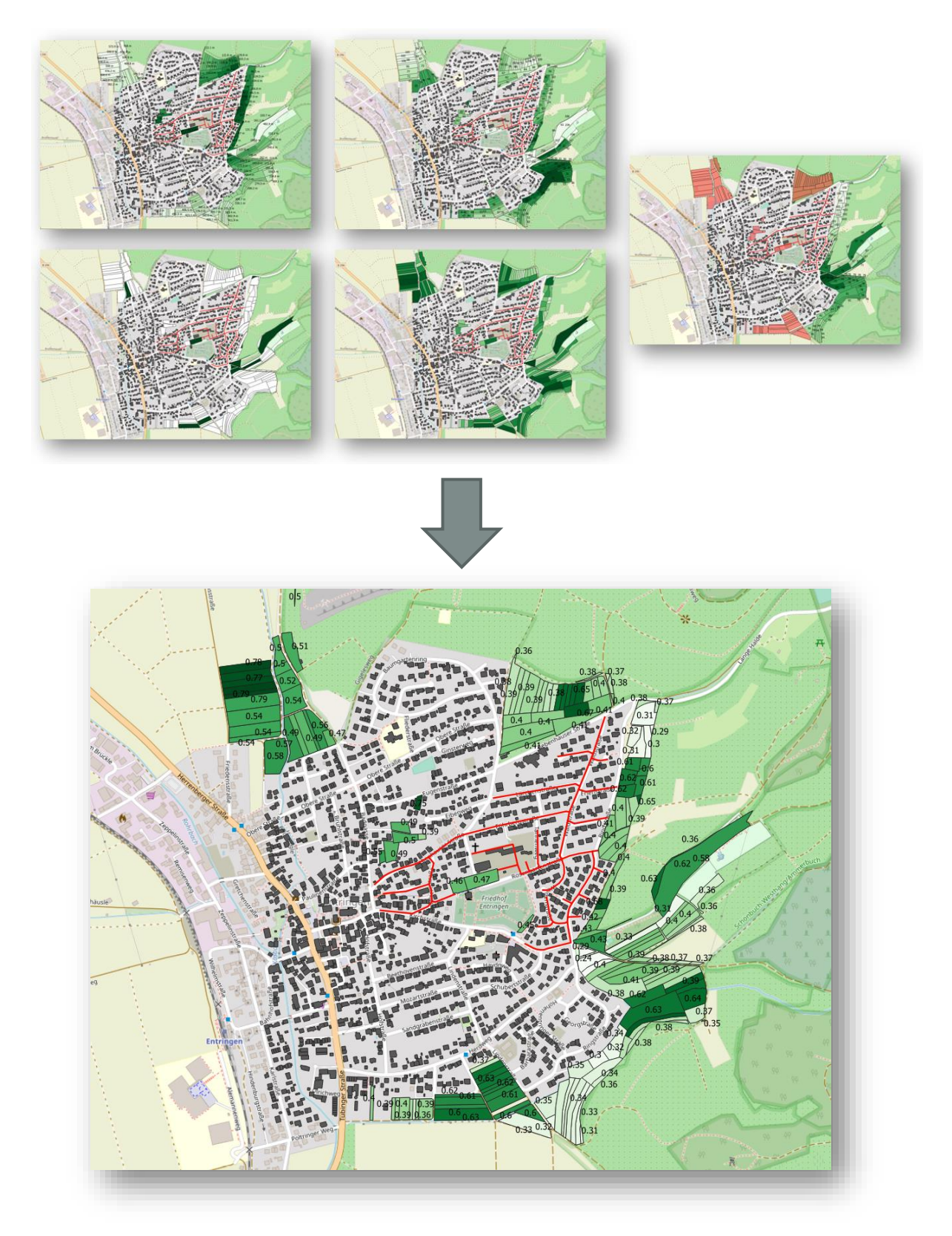
Figure 5: The results visualized as a map

For all criteria maps can be created. Of course, the result can also be visualized as a map afterwards (see following figures).