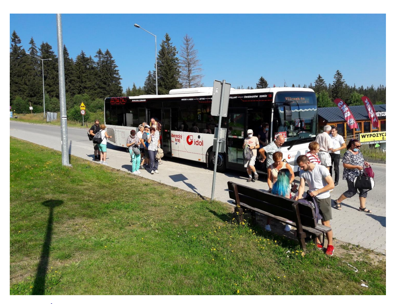
Bus stop in Świeradów-Zdrój (PL) at the lift station Mt. Izerski

The contract for co-financing of the bus line was prepared based on a similar contract for bus line 831.