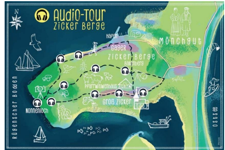
Promotional Postcard