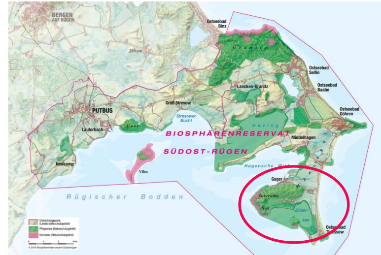
Map - Zoning