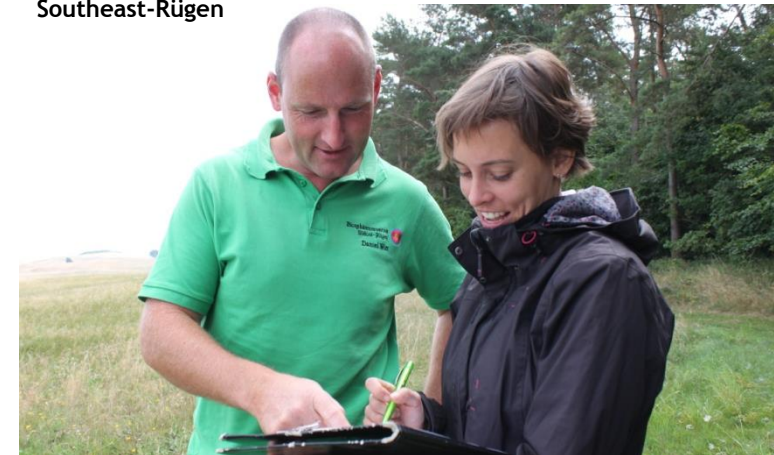
Visitor Questionnaires