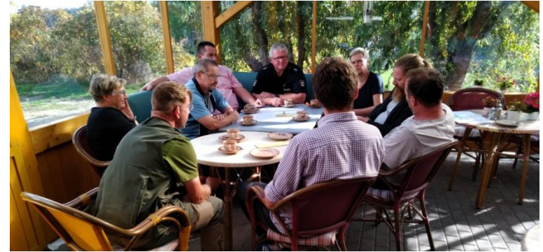
Stakeholder Workshop