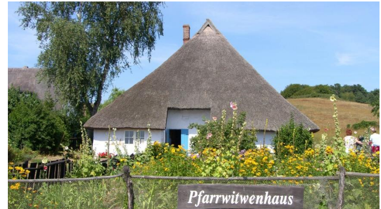
Parish Widow House, Groß Zicker