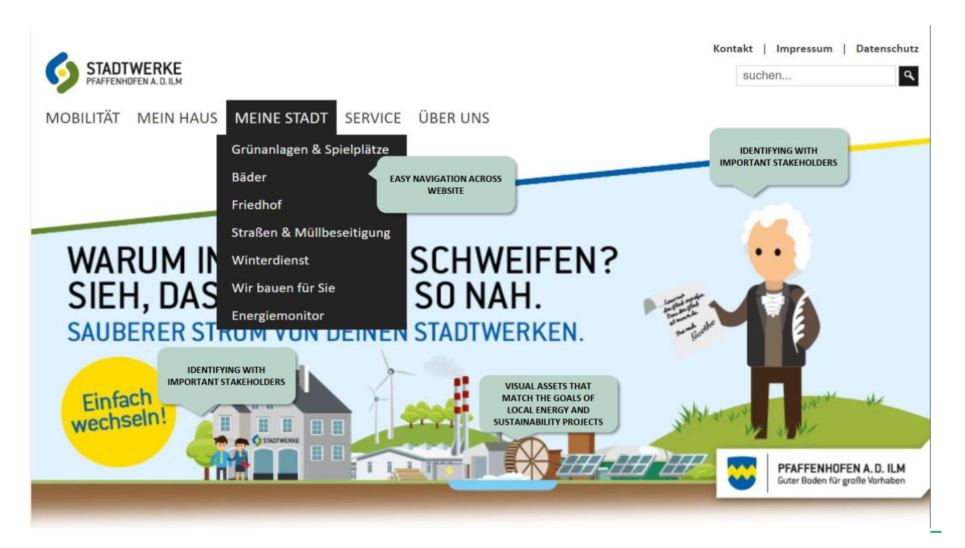
Tool 3 Example: Best Practice Communication

In the next issue of our newsletter, we are going to present you next interesting tool: The Community Energy Investment Guidelines - technical, business and legal aspects (Tool 2).