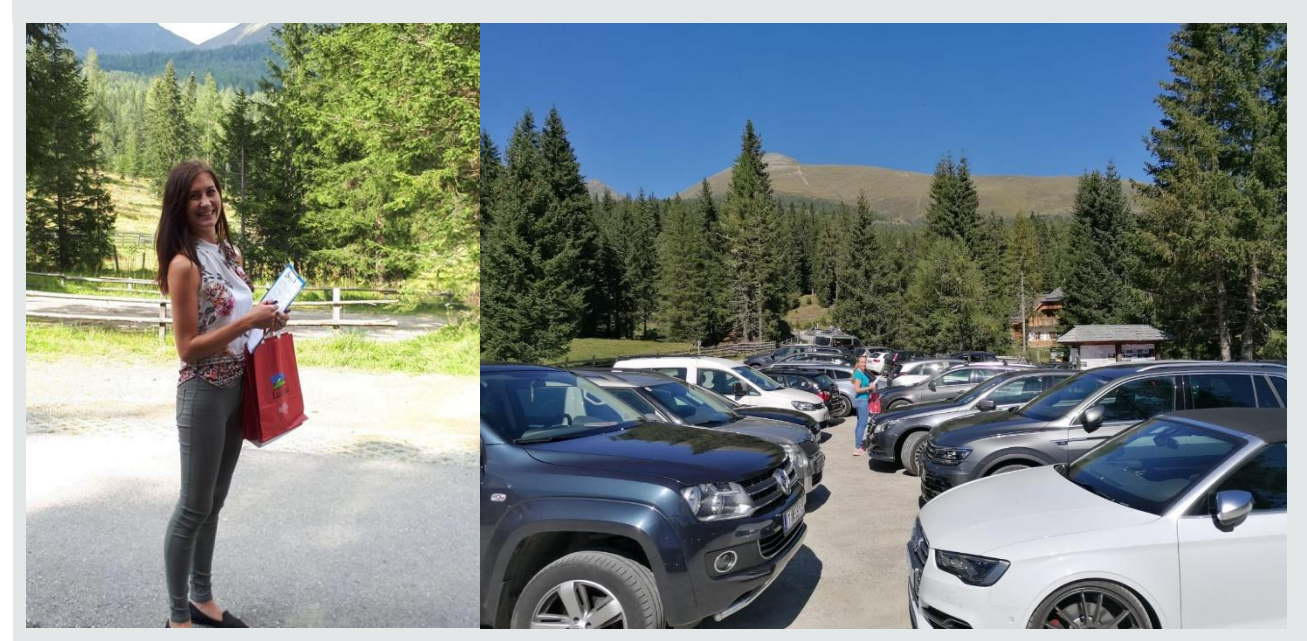
Picture 2&3: Visitor survey at the parking lots around the Lake Prebersee