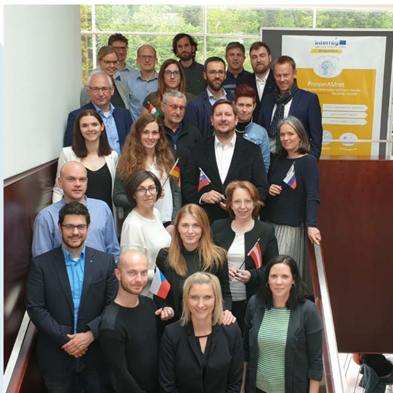
Group photo of the partnership at the ProsperAMnet kick-off meeting on 6-7 May 2019