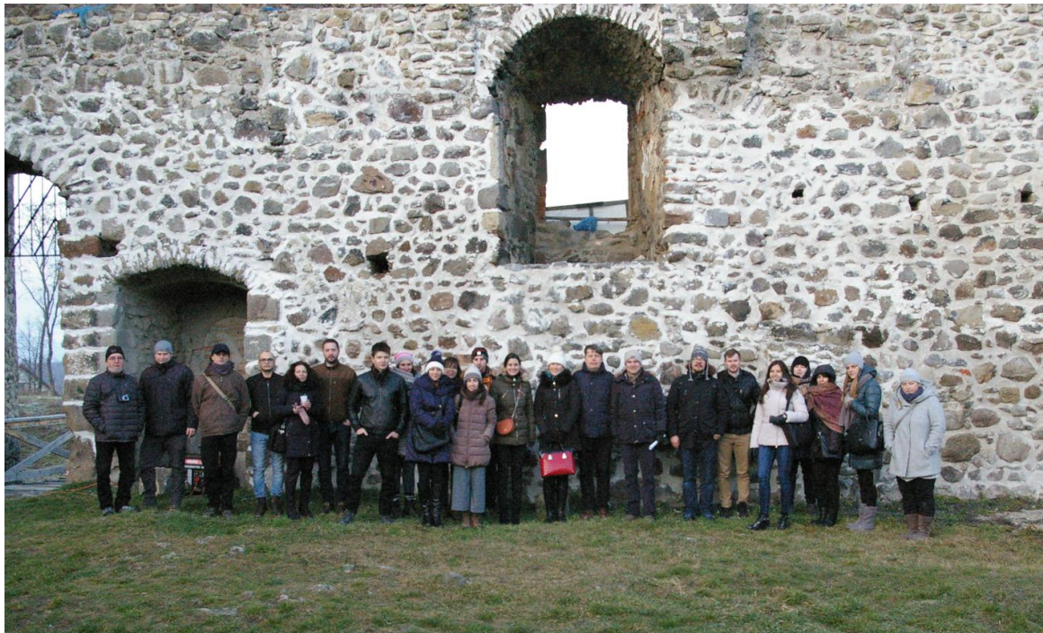
Participants of study visit in fort Bzovík

To get more details about study visit in Bzovík Monastery please click http://www.interreg-central.eu/Content.Node/study-visit-report-Slovakia-Bzovik.pdf