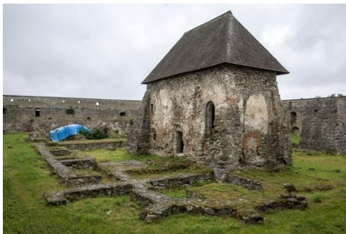
Ruins of Balassa's Chapel

Within 13th century Bzovík monastery became a target of attacks, and the complex burnt completely several times, but each time the monastery was always rebuilt again. During the fights between the followers of Polish Vladislaus II of Hungary and Hungarian Elizabeth, local area was devastated by the soldiers of Jan Jiskra (former Hussite commander) that were stationed in nearby Krupina. During this time the monastery was rebuilt in Gothic Style. The chapel was added to the old Romanesque single nave church with two towers in 1444-1446. A new monastery wing and paradise garden were also built. In east wing there was sacristy, monks cells, and big hall, kitchen, dining room and cupboards. In West wing were three rooms. Monastery had 4 wings altogether. In south wing a port was built. In the year 1471 some parts of monastery were damaged and burned down by angry citizens from Krupina. The farm yard and farmhouse were destroyed in these times.