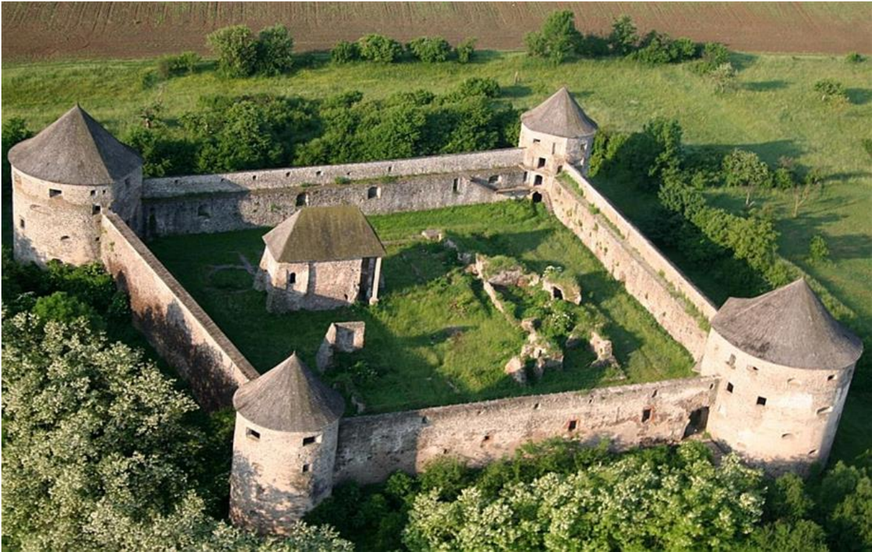
Current state of Bzovík Monastery