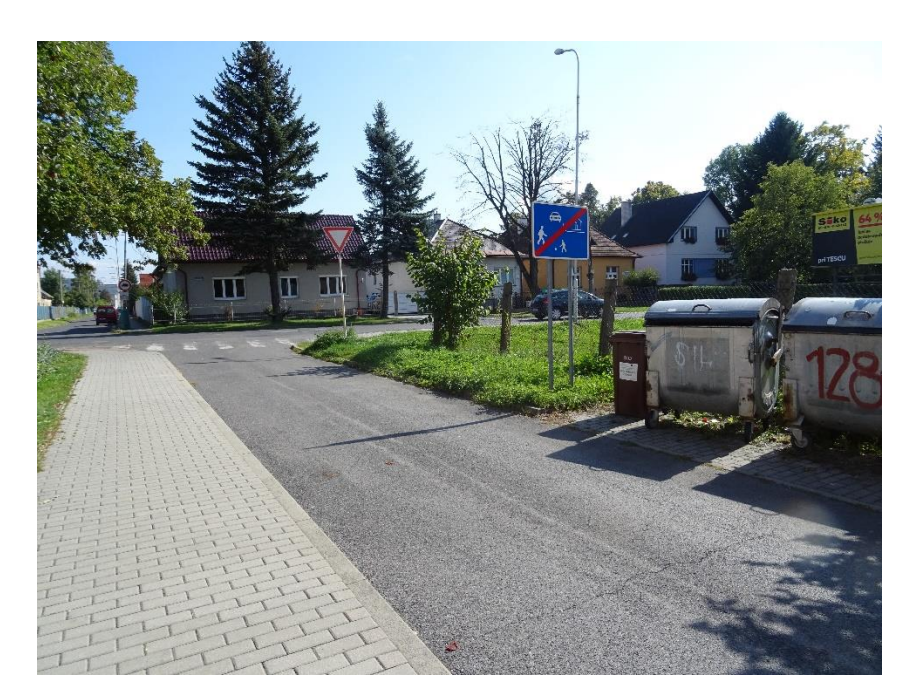
Fig. 2 - Site 19

This is a green belt along the road approximately 21m long and 2m wide including a container stand (Fig. 2). There are very active citizens living in the area. This is one of the few areas not landscaped in the locality. Based on the Living Lab, it was agreed with the citizens to modify the green belt by planting a summer garden and modifying the container stand with green elements.