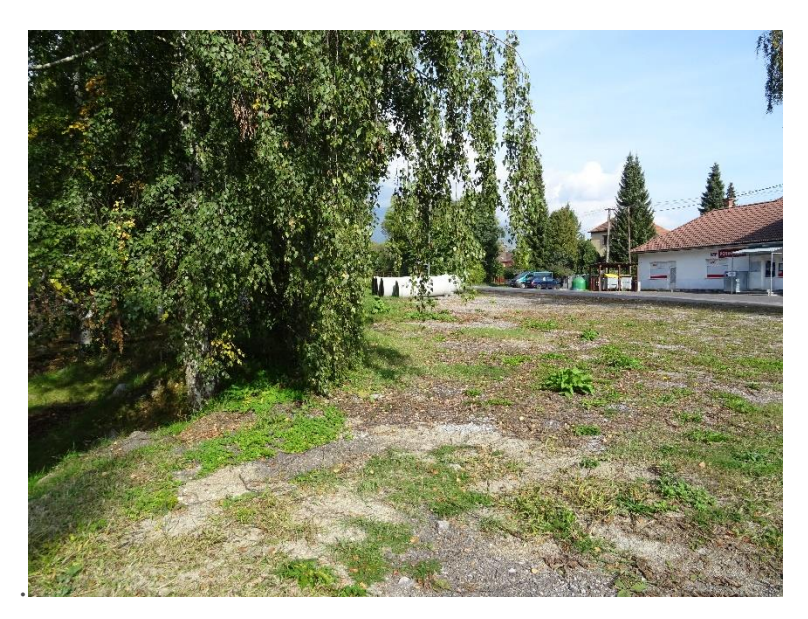
Fig. 8 Smrečany - car park