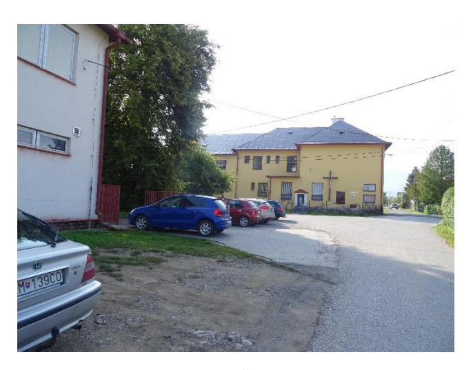
Obr. 6 Obec Lubela - Pošta

Site 3 Playground (49.0495339N, 19.4831142E). The site has an interesting position in the structure of the municipality. It is a relatively large space that could be used for a variety of community activities. In agreement with the municipality's leadership, the municipality's leadership will consider adding amenities rather than green features in the near future. These should follow the final conception of the whole area.