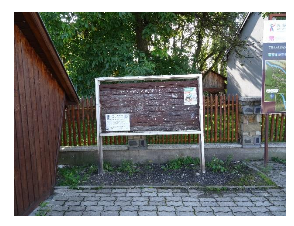
Fig. 9 Uhorská Ves - Area for container stand and notice board