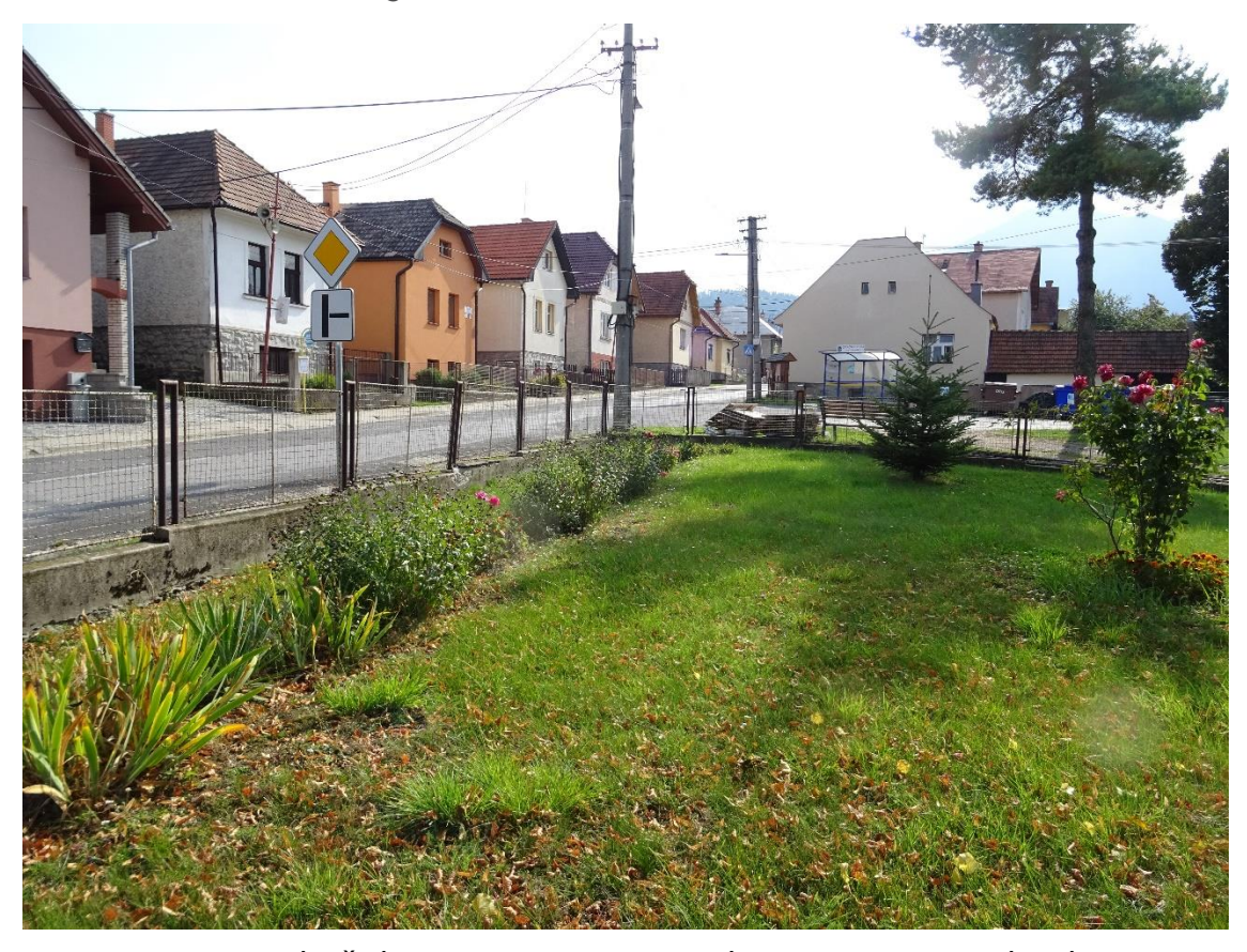
Obr. 11 Závažná Poruba lokalita u pomníku

The northern part (Fig. 11) consists of the site next to the monument. IURS will prepare visuals of the area and conduct a Living Lab with citizens over these proposals. The municipality can handle the actual implementation with its own budget.