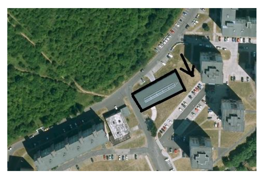
Fig. 3 Garage house

The land surrounding the garage house is owned by the city. This is the area defined by the car park, garage house, road, and apartment building in the southern part of the Podbreziny housing estate. The Podbreziny housing estate is significantly above average in terms of site identification by citizens. This is an area of great interest and with great potential for resident involvement. The proposed area should also be subject to wider discussion in the context of the approved estate revitalisation plan. Whilst planting alone would certainly have a positive effect, the area has the potential to be more significantly engaged. Even though this is an interesting site it is advisable to give the project sufficient time and space so that the potential of the whole site is used to the best advantage. However, Liptovský Mikuláš insists on a solution according to the project "Revitalisation of the Podberziny housing estate" (for which a zoning decision has been issued), in case of suitable calls for funding from external sources.