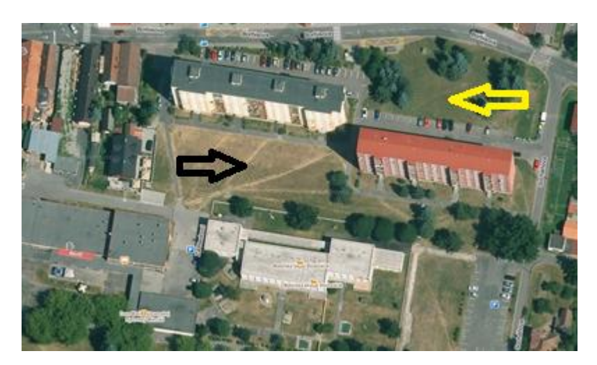
Fig. 4 Site 13 (base on www.mapy.cz)

Site 26 Residential house Hrušková/ Morušová ul. (49.0859092N, 19.6522469E)