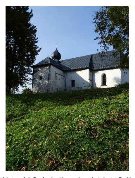
Fig.10 Liptovský Ondrej - Near church

Site 2 Near church (49.1021694N, 19.7119531E) (Fig. 10) is owned by the church and belongs to the church and rectory building which is a listed building. The municipality does not have any specific plans for this site, the only problem being the trees that the municipality intends to cut down to protect the monument and to improve the watercourse. This site is an unfortunate choice. Nevertheless, it has been agreed with the municipality that if this is possible, simple proposals will be prepared to improve the site. However, the municipality is not expected to initiate the implementation.