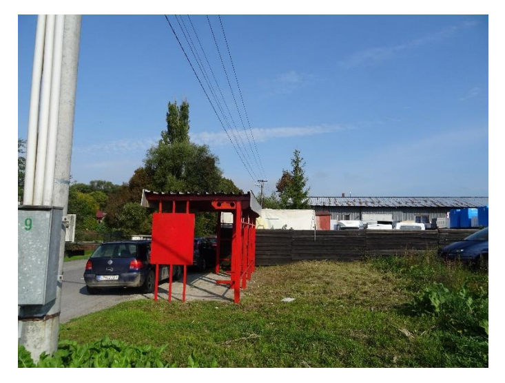
Fig. 5 Lubela - Public transport stop

Site 1 Public transport stop (Fig.5) (49.0485775N, 19.4771631E) is a stop with an iron structure in the outskirts of the village. The bus stop is currently in a condition that provides basic protection for those waiting but is repulsive and uninviting. Due to the immediate surroundings - power line pole it is not appropriate to consider activities around the bus stop. However, the existing bus stop structure could be used to great advantage to accommodate climbing plants. IURS will prepare a visualisation of the solution for the municipality, which will be presented to the citizens. The municipality expects that it will be able to carry out any improvements from its own budget, possibly in cooperation with citizens who will also participate in minor maintenance of the greenery.