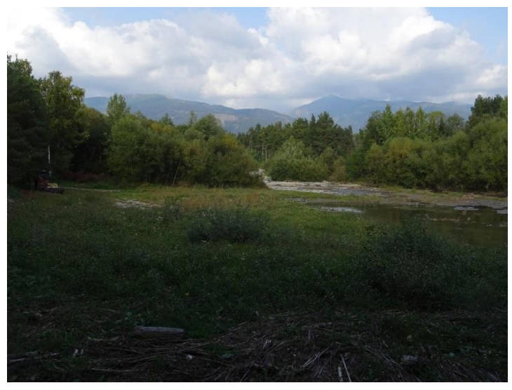
Fig. 1 FUA Liptovský Mikuláš

The document is divided according to the different municipalities involved. For the municipalities outside Liptovský Mikuláš, the agreed activities with the partner IURS - Institute for Sustainable Development of Settlements are also listed.