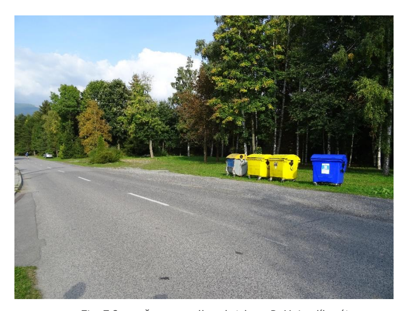
Fig. 7 Smerečany - small park

Site 1 Small Park (49.1227458N, 19.6539564E) (Fig. 7)- site in the northern part of the village. Part of it was formerly used as a bus turning point. The site is directly below the village conservation area. The site is politically exposed as it is a suitable location for the siting of houses. The site is owned by the municipality and the citizens do not wish to see the site sold to private ownership for development. In agreement with the municipal leadership, IURS will prepare a visualisation of the location of the bins in the peripheral part of the site, including the design of the shelter. These visualizations will be discussed with the citizens and the municipality is ready to implement this shelter from its own budget.