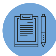
PROVIDES RESEARCH BASED GUIDELINES

SiforREF aims to support policy makers, practitioners and NGOs as operators in the design and implementation of measures to improve societal and economic integration of refugees.