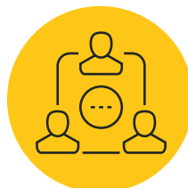
PROCESS DIMENSION To transform social relations regarding governance