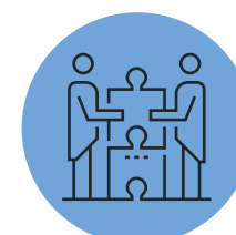
ORGANISES CAPACITY-BUILDING ACTIVITIES IN THE CITIES INVOLVED 8