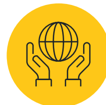
EMPOWERMENT DIMENSION To increase socio-political capabilities & access to resources for refugees

SiforREF PROVIDES A METHODOLOGICAL TOOL-BOX FOR IMPLEMENTING SOCIAL INNOVATION