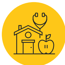
CONTENT DIMENSION To satisfy the basic social needs of refugees

Social innovation fosters social inclusion and counters conservative forces that prevent it. Social innovation encourages bottom-up participation, the protection of citizen's rights and collective decision-making systems.