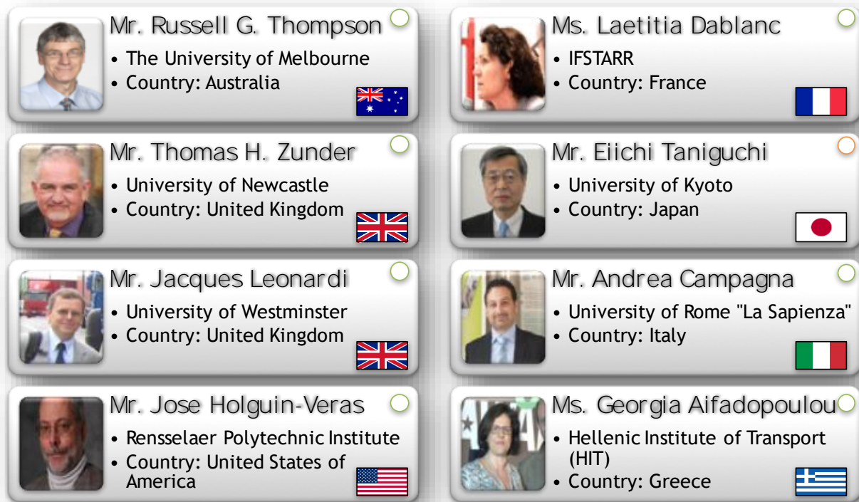
Figure 1 Scientific Committee of the SULPiTER project