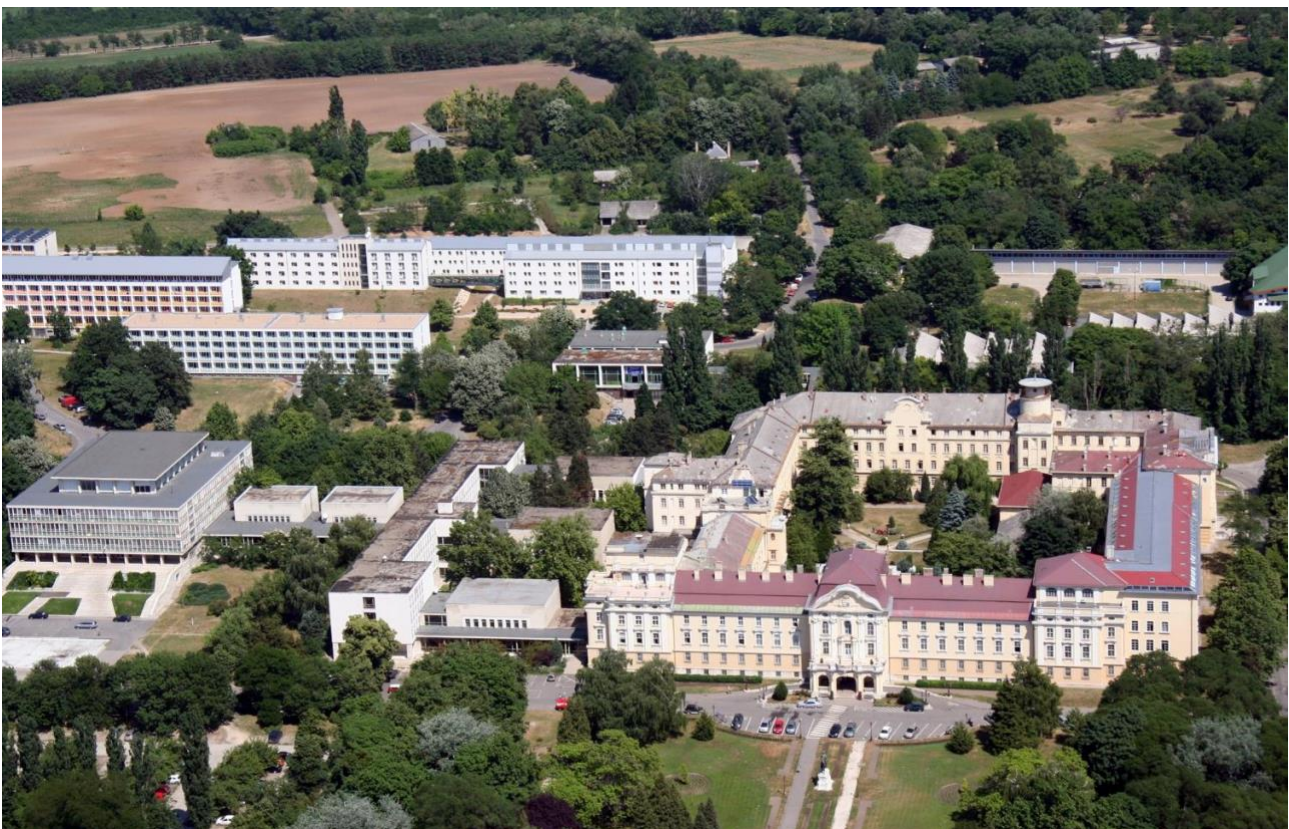
Gödöllő Campus of the MATE Hungarian University of Agriculture and Life Sciences