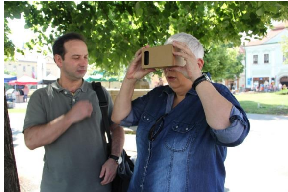
Paper Virtual Reality glasses, cardboard by Google for smart phone, tested in town of Slaný.